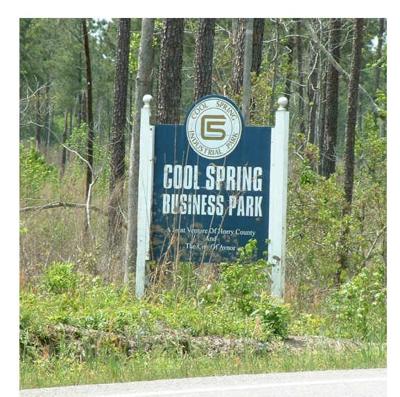
Cool Spring Business Park Sign

The South Carolina Power Team (which includes the state's electric cooperatives and Santee Cooper) is the only statewide electric utility and the largest electric power system in the state. Information available from the South Carolina Power Team indicates that industrial parks in the area include the I-95 Gateway Industrial Park, a 400-acre park located adjacent to I-95, and Marion County Industrial Park,