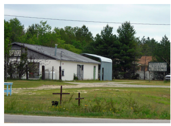
Charlie's Auction and Water System

Alternative 2 would potentially impact Charlie's Auction and Water System in Hamlet, North Carolina. The site, described in the previous paragraph, would be located adjacent to the proposed ROW of Alternative 2