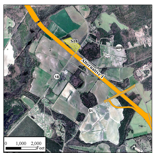
Figure 3-35 Location of Resource 0918

Alternative 3 would directly impact the property surrounding the McLaurin House (Resource 78002526) located on State Route 40 east of Clio, which is listed on the NRHP since it is an excellent example of Italianate architecture style (refer to Figure 3-36, page 3-124). There are also several outbuildings associated