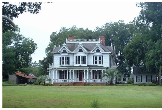
The McLaurin House