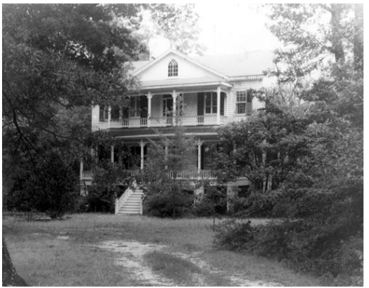
The Appin Historic District