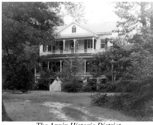
The Appin Historic District

While special measures are required by federal agencies to avoid and minimize impacts to potentially eligible and NRHP listed sites, there are no such requirements for private developers. Development in the areas of the historic resources could change the rural nature of the viewshed, which in turn may diminish the historical significance of