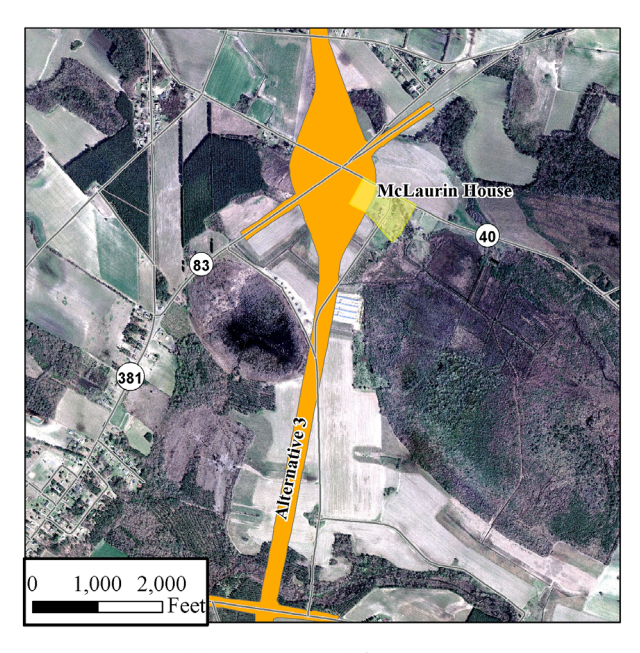
Figure C-32 Location of the McLaurin House

Alternative 3 would directly impact the property surrounding the McLaurin House (Resource 78002526) located on State Route 40 east of Clio, which is listed on the NRHP since it is an excellent example of Italianate architecture style (refer to Figure C-32). There are also several outbuildings associated with the McLaurin House that support the agricultural emphasis of the property. This resource is located east of Clio on State Route 40 East.